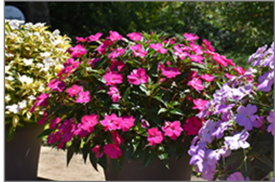
SunPatiens Vigorous Rose Pink New Guinea Impatiens in bloom

SunPatiens Vigorous Rose Pink New Guinea Impatiens will grow to be about 3 feet tall at maturity, with a spread of 3 feet. When grown in masses or used as a bedding plant, individual plants should be spaced approximately 32 inches apart. Its foliage tends to remain dense right to the ground, not requiring facer plants in front. This fast-growing annual will normally live for one full growing season, needing replacement the following year.