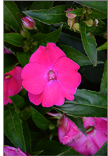
SunPatiens Vigorous Rose Pink New Guinea Impatiens flowers

This plant will require occasional maintenance and upkeep, and should not require much pruning, except when necessary, such as to remove dieback. It has no significant negative characteristics.