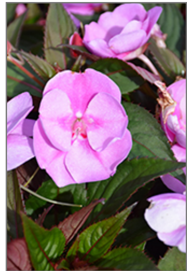
SunPatens Vigorous Lavender Splash New Guinea Impatiens flowers

Ann Arbor 734-332-7900 155 N. Maple at Jackson