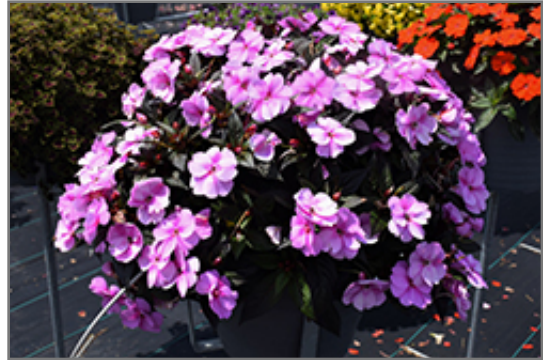
SunPatiens Vigorous Lavender Splash New Guinea Impatiens in bloom

SunPatiens Vigorous Lavender Splash New Guinea Impatiens is a fine choice for the garden, but it is also a good selection for planting in outdoor containers and hanging baskets. Because of its height, it is often used as a 'thriller' in the 'spiller-thriller-filler' container combination; plant it near the center of the pot, surrounded by smaller plants and those that spill over the edges. It is even sizeable enough that it can be grown alone in a suitable container. Note that when growing plants in outdoor containers and baskets, they may require more frequent waterings than they would in the yard or garden.