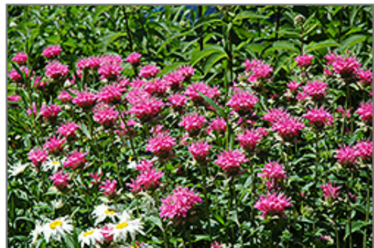
Marshall's Delight Beebalm flowers