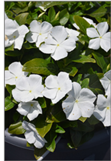
Cora XDR White flowers

Cora XDR White is recommended for the following landscape applications;