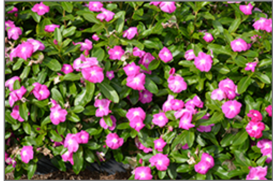
Cora XDR Orchid in bloom