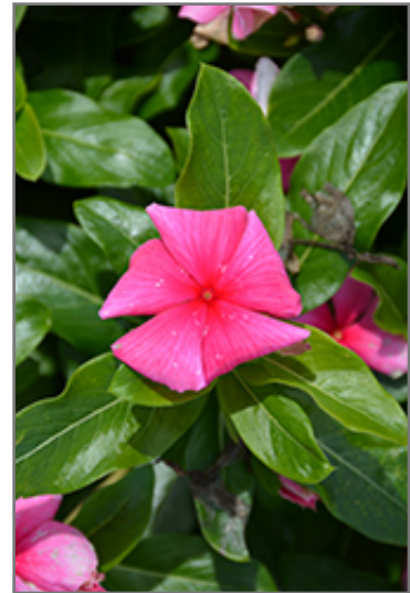
Cora XDR Deep Strawberry flowers

Cora XDR Deep Strawberry is recommended for the following landscape applications;