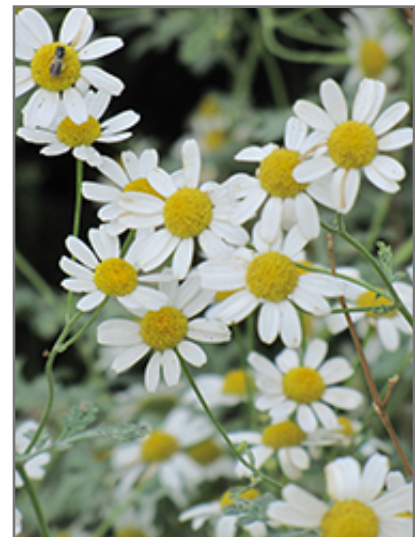
German Chamomile flowers