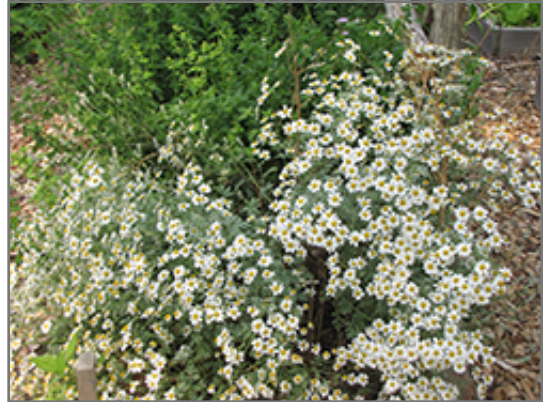
German Chamomile

This plant is quite ornamental as well as edible, and is as much at home in a landscape or flower garden as it is in a designated herb garden. It does best in full sun to partial shade. It is very adaptable to both dry and moist locations, and should do just fine under typical garden conditions. It is not particular as to soil type or pH. It is somewhat tolerant of urban pollution. This species is not originally from North America.