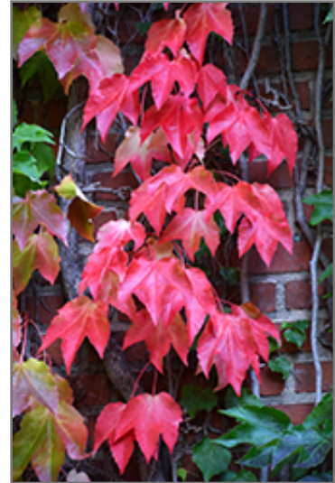
Boston Ivy in fall