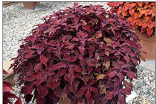
ColorBlaze Royale Cherry Brandy Coleus