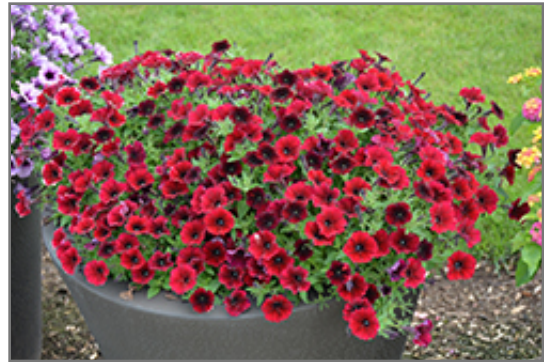
Supertunia Black Cherry Petunia in bloom