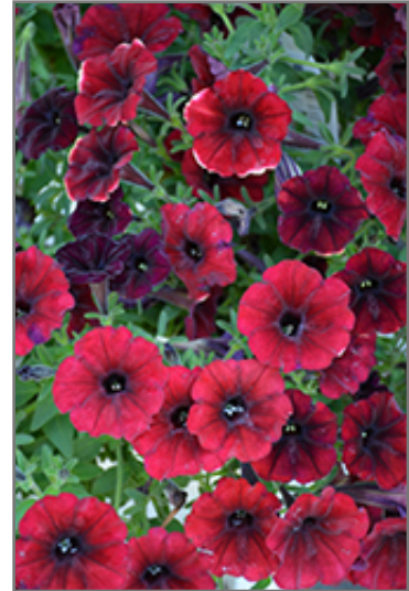
Supertunia Black Cherry Petunia flowers

Supertunia Black Cherry Petunia is a dense herbaceous annual with a trailing habit of growth, eventually spilling over the edges of hanging baskets and containers. Its medium texture blends into the garden, but can always be balanced by a couple of finer or coarser plants for an effective composition.