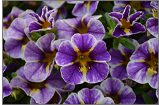
Superbells Holy Smokes! Calibrachoa flowers

Superbells Holy Smokes! Calibrachoa is a dense herbaceous annual with a trailing habit of growth, eventually spilling over the edges of hanging baskets and containers. Its medium texture blends into the garden, but can always be balanced by a couple of finer or coarser plants for an effective composition.