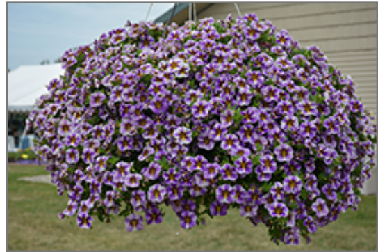
Superbells Holy Smokes! Calibrachoa in bloom