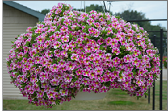
Superbells Holy Cow! Calibrachoa in bloom