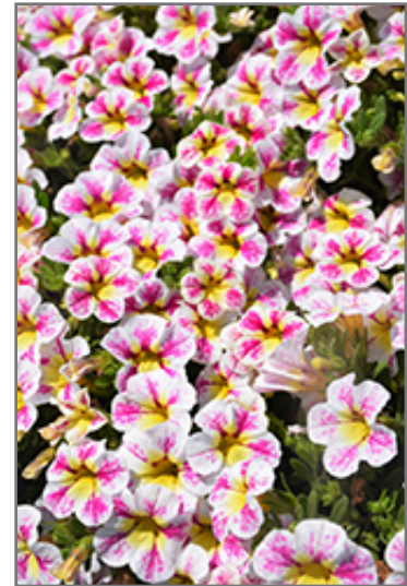
Superbells Holy Cow! Calibrachoa flowers

Superbells Holy Cow! Calibrachoa is a dense herbaceous annual with a trailing habit of growth, eventually spilling over the edges of hanging baskets and containers. Its medium texture blends into the garden, but can always be balanced by a couple of finer or coarser plants for an effective composition.