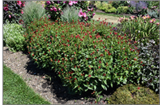
Little Redhead Indian Pink in bloom

Little Redhead Indian Pink will grow to be about 20 inches tall at maturity, with a spread of 24 inches. When grown in masses or used as a bedding plant, individual plants should be spaced approximately 20 inches apart. Its foliage tends to remain dense right to the ground, not requiring facer plants in front. It grows at a fast rate, and under ideal conditions can be expected to live for approximately 5 years. As an herbaceous perennial, this plant will usually die back to the crown each winter, and will regrow from the base each spring. Be careful not to disturb the crown in late winter when it may not be readily seen!