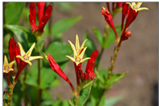
Little Redhead Indian Pink flowers