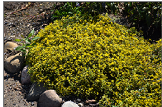
Rock 'N Low Yellow Brick Road Stonecrop in bloom