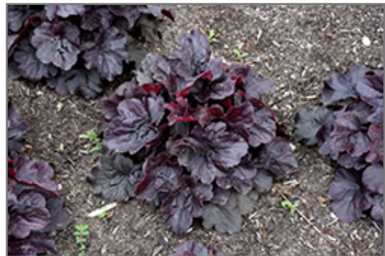
Northern Exposure Black Coral Bells