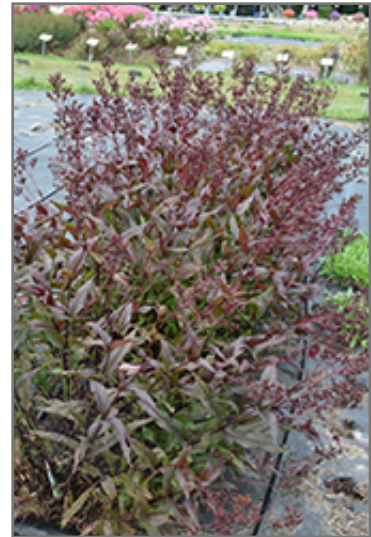
Pocahontas Beard Tongue

This is a relatively low maintenance plant, and is best cleaned up in early spring before it resumes active growth for the season. It is a good choice for attracting butterflies to your yard. It has no significant negative characteristics.