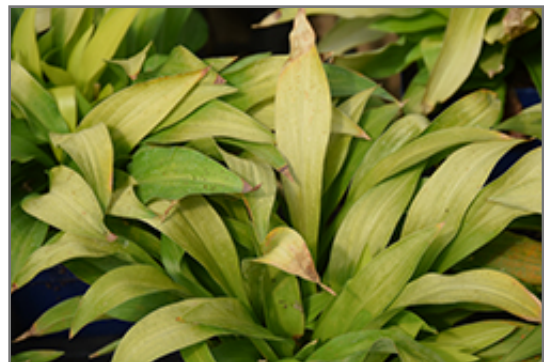
Munchkin Fire Hosta foliage

Ann Arbor 734-332-7900 155 N. Maple at Jackson