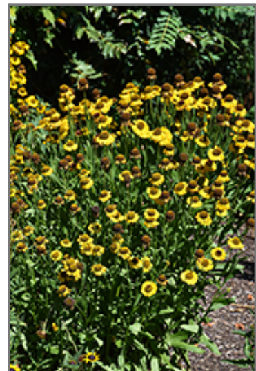
Salud Golden Sneezeweed in bloom