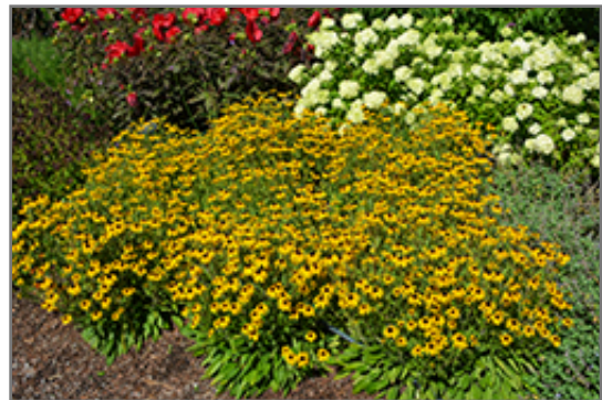
American Gold Rush Coneflower in bloom

Ann Arbor 734-332-7900 155 N. Maple at Jackson