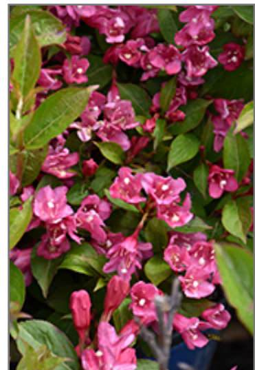
Date Night Strobe Weigela flowers