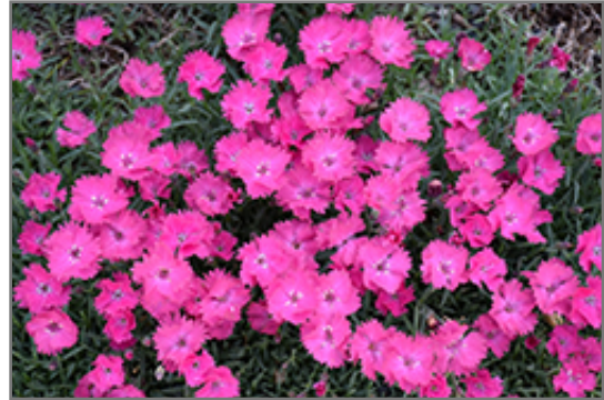
Vivid Bright Light Pinks flowers

Vivid Bright Light Pinks is recommended for the following landscape applications;