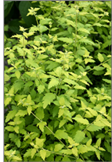
Sunshine Blue II Caryopteris foliage

Sunshine Blue II Caryopteris makes a fine choice for the outdoor landscape, but it is also well-suited for use in outdoor pots and containers. With its upright habit of growth, it is best suited for use as a 'thriller' in the 'spiller-thriller-filler' container combination; plant it near the center of the pot, surrounded by smaller plants and those that spill over the edges. It is even sizeable enough that it can be grown alone in a suitable container. Note that when grown in a container, it may not perform exactly as indicated on the tag - this is to be expected. Also note that when growing plants in outdoor containers and baskets, they may require more frequent waterings than they would in the yard or garden.