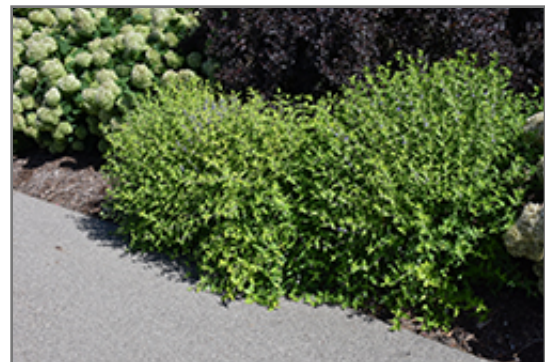
Sunshine Blue II Caryopteris in bloom