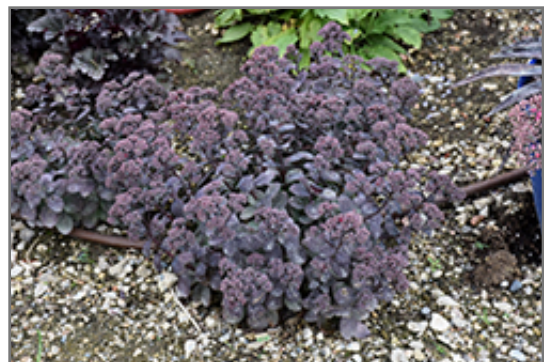
Rock 'N Grow Superstar Stonecrop in bloom

Ann Arbor 734-332-7900 155 N. Maple at Jackson