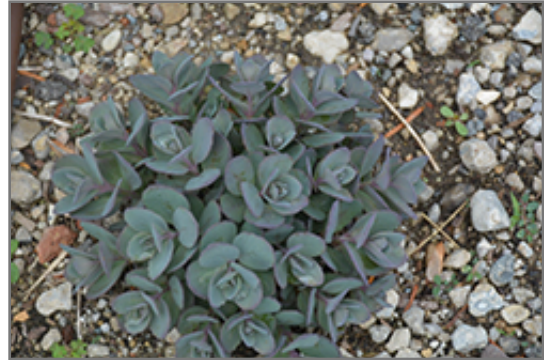
Rock 'N Grow Superstar Stonecrop