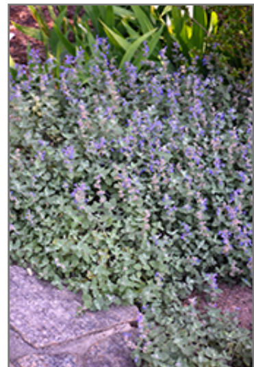
Early Bird Catmint in bloom