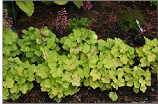
Primo Pretty Pistachio Coral Bells

Primo Pretty Pistachio Coral Bells will grow to be about 10 inches tall at maturity extending to 22 inches tall with the flowers, with a spread of 28 inches. When grown in masses or used as a bedding plant, individual plants should be spaced approximately 26 inches apart. Its foliage tends to remain low and dense right to the ground. It grows at a medium rate, and under ideal conditions can be expected to live for approximately 10 years. As an evergreen perennial, this plant will typically keep its form and foliage year-round.