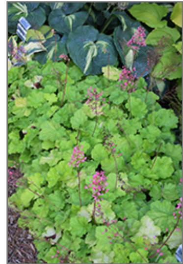
Primo Pretty Pistachio Coral Bells in bloom

This is a relatively low maintenance plant, and should be cut back in late fall in preparation for winter. It is a good choice for attracting butterflies and hummingbirds to your yard. It has no significant negative characteristics.