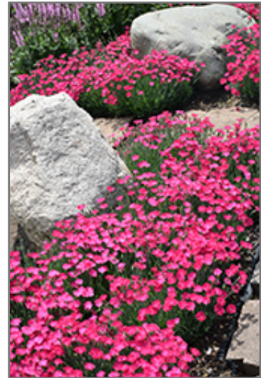
Paint The Town Magenta Pinks in bloom

Paint The Town Magenta Pinks is an herbaceous evergreen perennial with a mounded form. It brings an extremely fine and delicate texture to the garden composition and should be used to full effect.