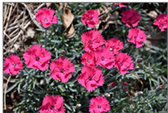
Paint The Town Magenta Pinks flowers

Ann Arbor 734-332-7900 155 N. Maple at Jackson