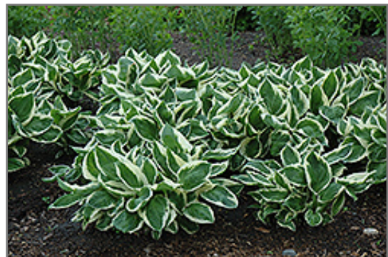
Minuteman Hosta