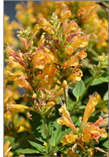
Poquito Butter Yellow Hyssop flowers

Poquito Butter Yellow Hyssop is recommended for the following landscape applications;