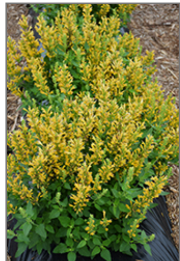
Poquito Butter Yellow Hyssop in bloom