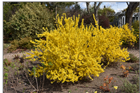
Magical Gold Forsythia in bloom

Ann Arbor 734-332-7900 155 N. Maple at Jackson