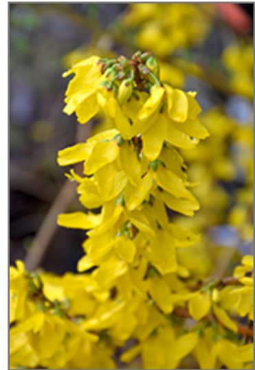
Magical Gold Forsythia flowers

Magical Gold Forsythia makes a fine choice for the outdoor landscape, but it is also well-suited for use in outdoor pots and containers. Because of its height, it is often used as a 'thriller' in the 'spiller-thriller-filler' container combination; plant it near the center of the pot, surrounded by smaller plants and those that spill over the edges. It is even sizeable enough that it can be grown alone in a suitable container. Note that when grown in a container, it may not perform exactly as indicated on the tag - this is to be expected. Also note that when growing plants in outdoor containers and baskets, they may require more frequent waterings than they would in the yard or garden.