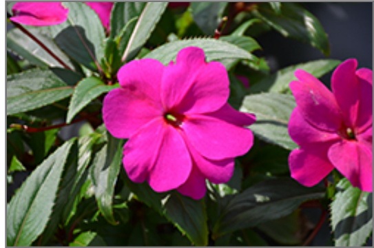
Divine Orchid New Guinea Impatiens flowers

Divine Orchid New Guinea Impatiens is recommended for the following landscape applications;