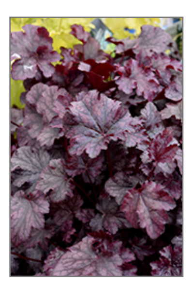
Plum Pudding Coral Bells foliage

This is a relatively low maintenance plant, and should be cut back in late fall in preparation for winter. It is a good choice for attracting hummingbirds to your yard. It has no significant negative characteristics.