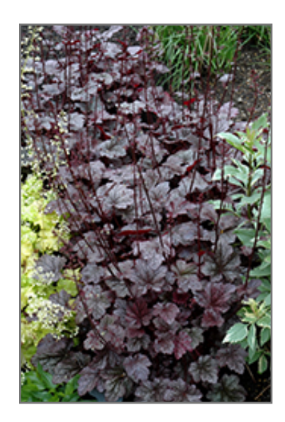
Plum Pudding Coral Bells in bloom

Ann Arbor 734-332-7900 155 N. Maple at Jackson