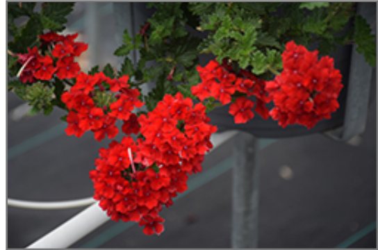
Superbena Royale Red Verbena flowers

This plant will require occasional maintenance and upkeep. Trim off the flower heads after they fade and die to encourage more blooms late into the season. Deer don't particularly care for this plant and will usually leave it alone in favor of tastier treats. It has no significant negative characteristics.