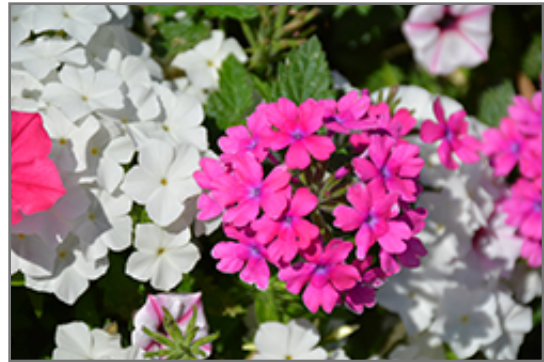
Superbena Pink Shades Verbena flowers

Superbena Pink Shades Verbena is recommended for the following landscape applications;