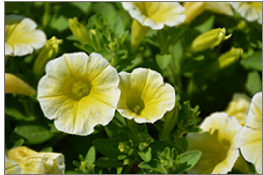
Blanket Yellow Petunia flowers

Blanket Yellow Petunia is recommended for the following landscape applications;