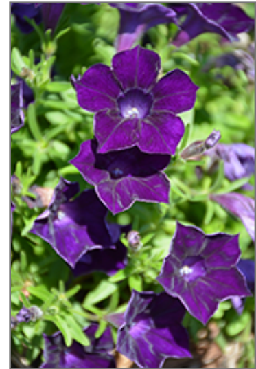
Blanket Midnight Velvet Petunia flowers

Blanket Midnight Velvet Petunia is recommended for the following landscape applications;