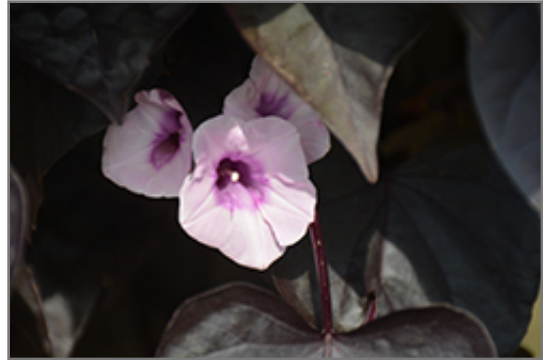
Sweet Caroline Sweetheart Jet Black Sweet Potato Vine flowers

Sweet Caroline Sweetheart Jet Black Sweet Potato Vine will grow to be about 12 inches tall at maturity, with a spread of 30 inches. Its foliage tends to remain dense right to the ground, not requiring facer plants in front. This fast-growing annual will normally live for one full growing season, needing replacement the following year.