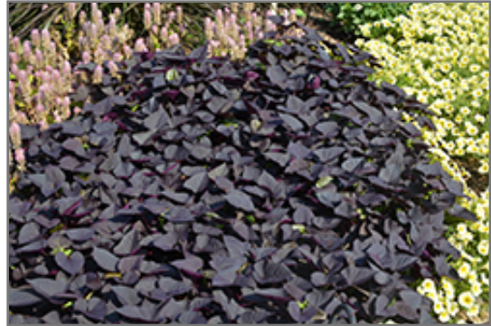
Sweet Caroline Sweetheart Jet Black Sweet Potato Vine

This is a relatively low maintenance plant. The flowers of this plant may actually detract from its ornamental features, so they can be removed as they appear. It has no significant negative characteristics.