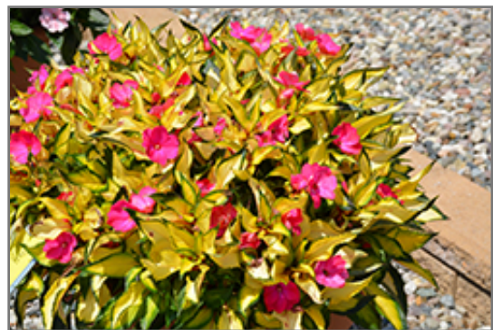
SunPatiens Compact Tropical Rose New Guinea Impatiens in bloom

Ann Arbor 734-332-7900 155 N. Maple at Jackson