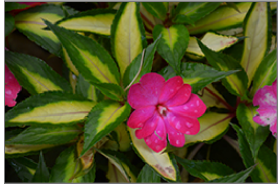
SunPatiens Compact Tropical Rose New Guinea Impatiens flowers