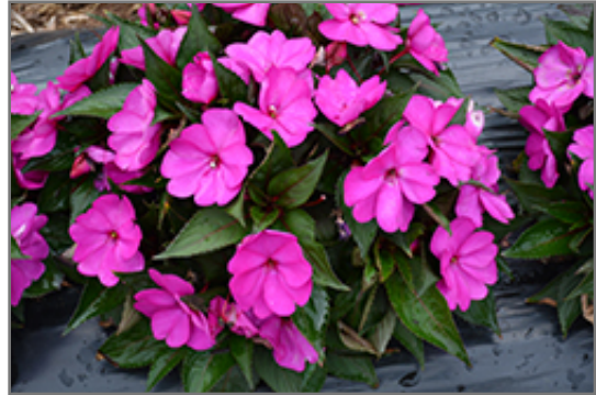
SunPatiens Compact Purple New Guinea Impatiens in bloom

SunPatiens Compact Purple New Guinea Impatiens will grow to be about 24 inches tall at maturity, with a spread of 24 inches. When grown in masses or used as a bedding plant, individual plants should be spaced approximately 20 inches apart. Its foliage tends to remain dense right to the ground, not requiring facer plants in front. This fast-growing annual will normally live for one full growing season, needing replacement the following year.