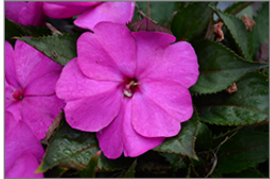
SunPatiens Compact Purple New Guinea Impatiens flowers

This plant will require occasional maintenance and upkeep, and should not require much pruning, except when necessary, such as to remove dieback. It has no significant negative characteristics.