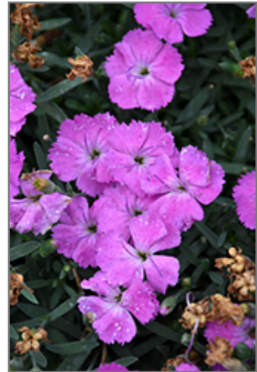
Paint The Town Fuchsia Pinks flowers

Paint The Town Fuchsia Pinks is an herbaceous evergreen perennial with a mounded form. It brings an extremely fine and delicate texture to the garden composition and should be used to full effect.