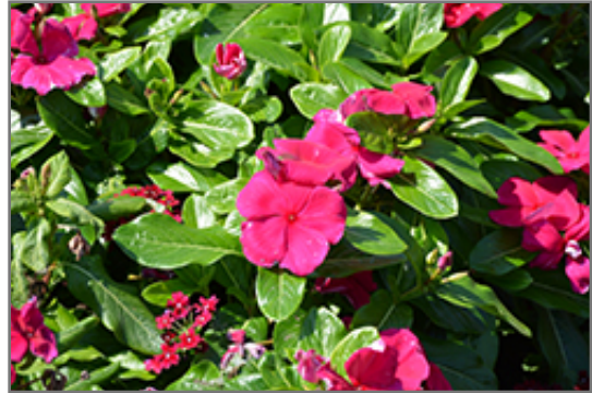
Cora Cascade Magenta Vinca flowers

Cora Cascade Magenta Vinca is recommended for the following landscape applications;