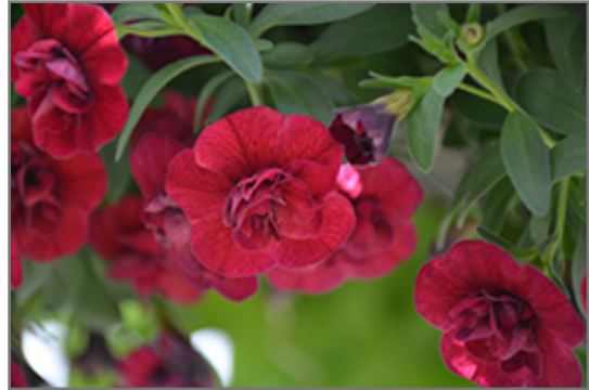
Superbells Double Ruby Calibrachoa flowers

Superbells Double Ruby Calibrachoa is recommended for the following landscape applications;