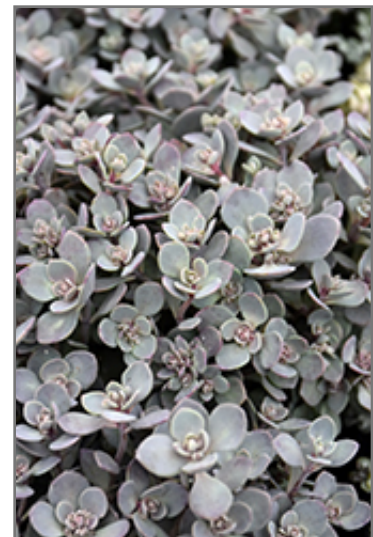
SunSparkler Blue Elf Sedoro foliage