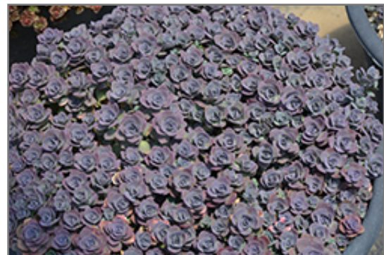
SunSparkler Blue Elf Sedoro