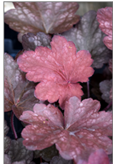
Carnival Candy Apple Coral Bells foliage

Ann Arbor 734-332-7900 155 N. Maple at Jackson