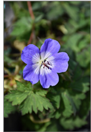
Azure Rush Cranesbill flowers

Azure Rush Cranesbill is recommended for the following landscape applications;