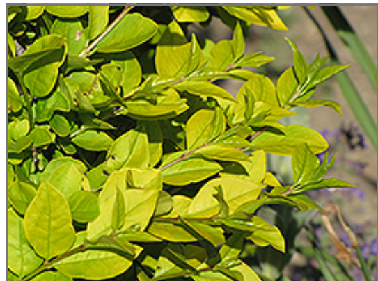
Golden Privet foliage