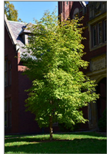
Three Flowered Maple