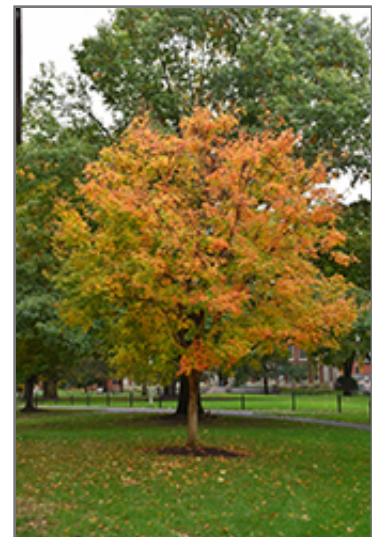
Three Flowered Maple in fall