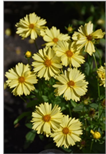
Leading Lady Lauren Tickseed flowers