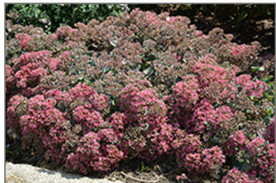
Popstar Stonecrop in bloom