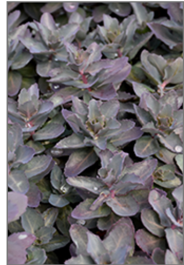
Cherry Truffle Stonecrop foliage

Cherry Truffle Stonecrop is a fine choice for the garden, but it is also a good selection for planting in outdoor pots and containers. It is often used as a 'filler' in the 'spiller-thriller-filler' container combination, providing a mass of flowers and foliage against which the larger thriller plants stand out. Note that when growing plants in outdoor containers and baskets, they may require more frequent waterings than they would in the yard or garden.