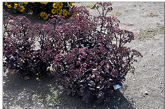
Cherry Truffle Stonecrop in bloom

Ann Arbor 734-332-7900 155 N. Maple at Jackson