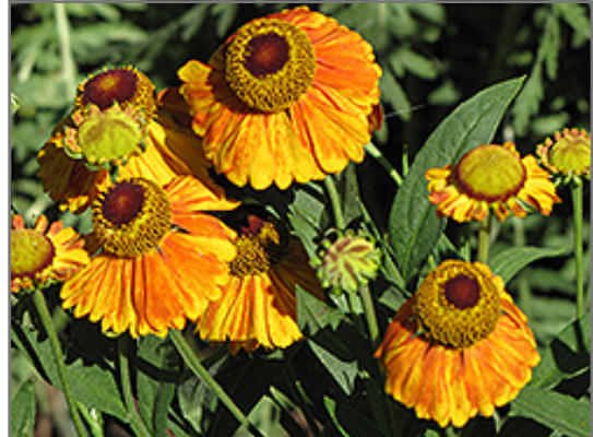
Mardi Gras Sneezweed flowers

Mardi Gras Sneezweed is an herbaceous perennial with an upright spreading habit of growth. Its medium texture blends into the garden, but can always be balanced by a couple of finer or coarser plants for an effective composition.